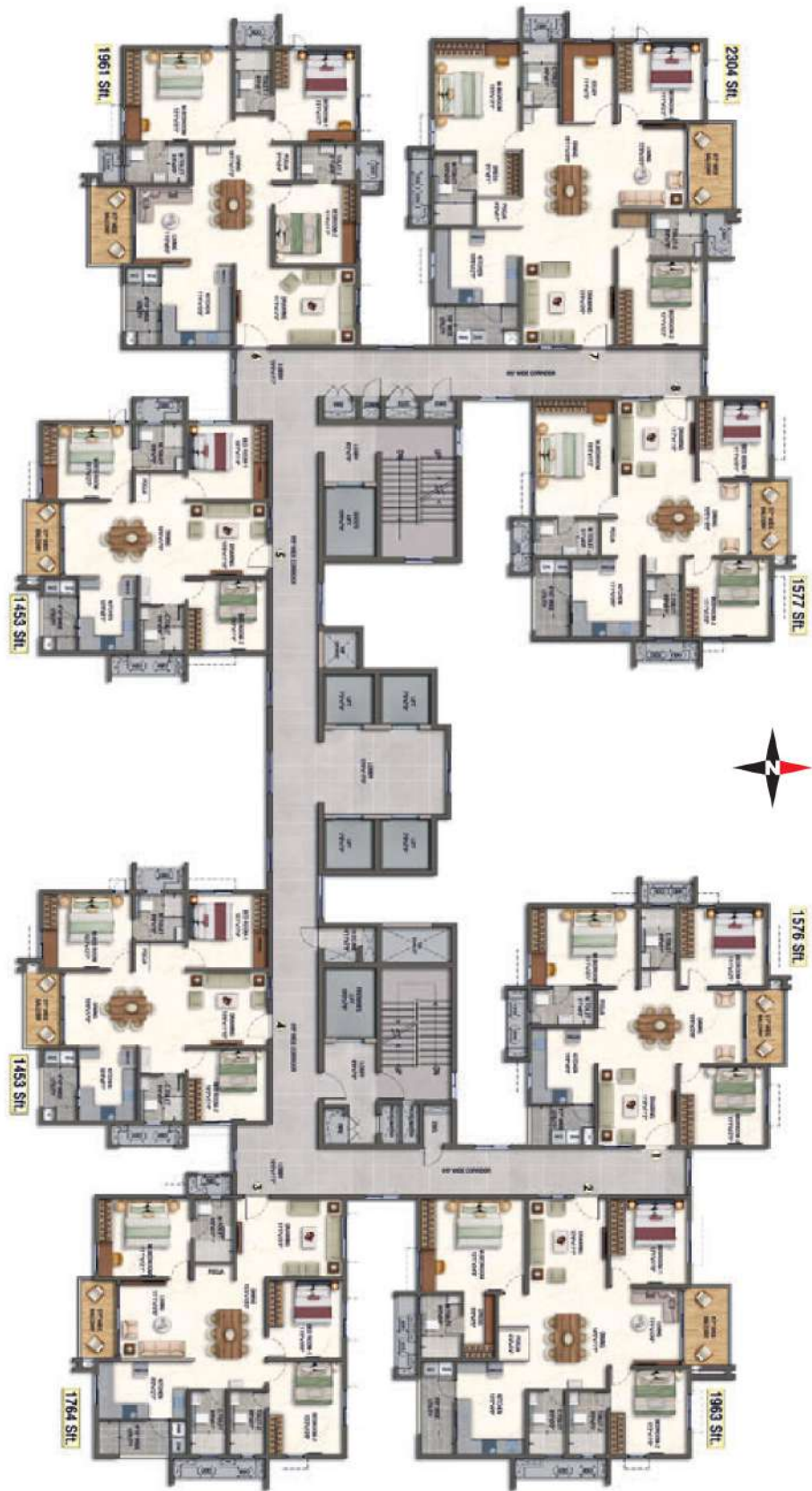
Floor Plan Block - A, B, C, D, E, F & H